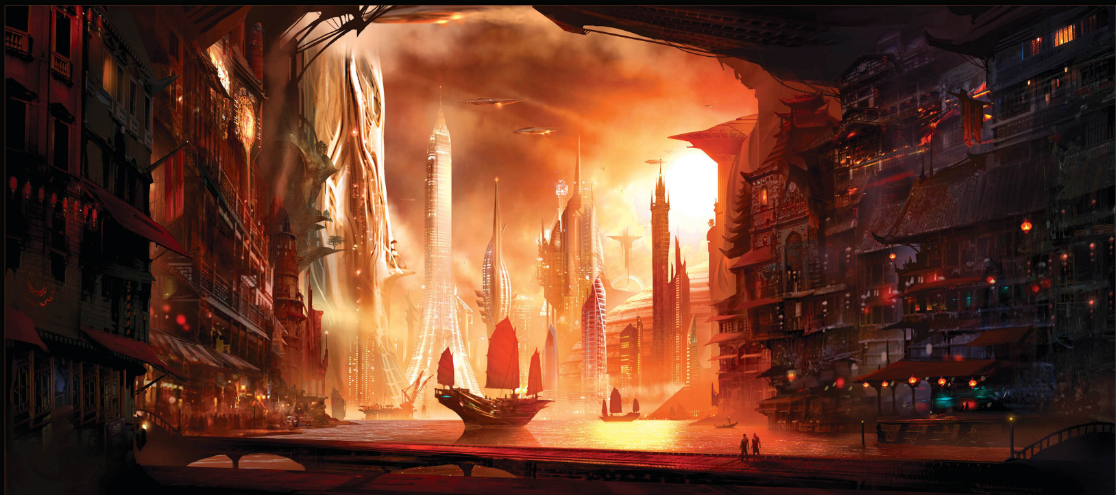
'FUTURE HARBOR' 2012