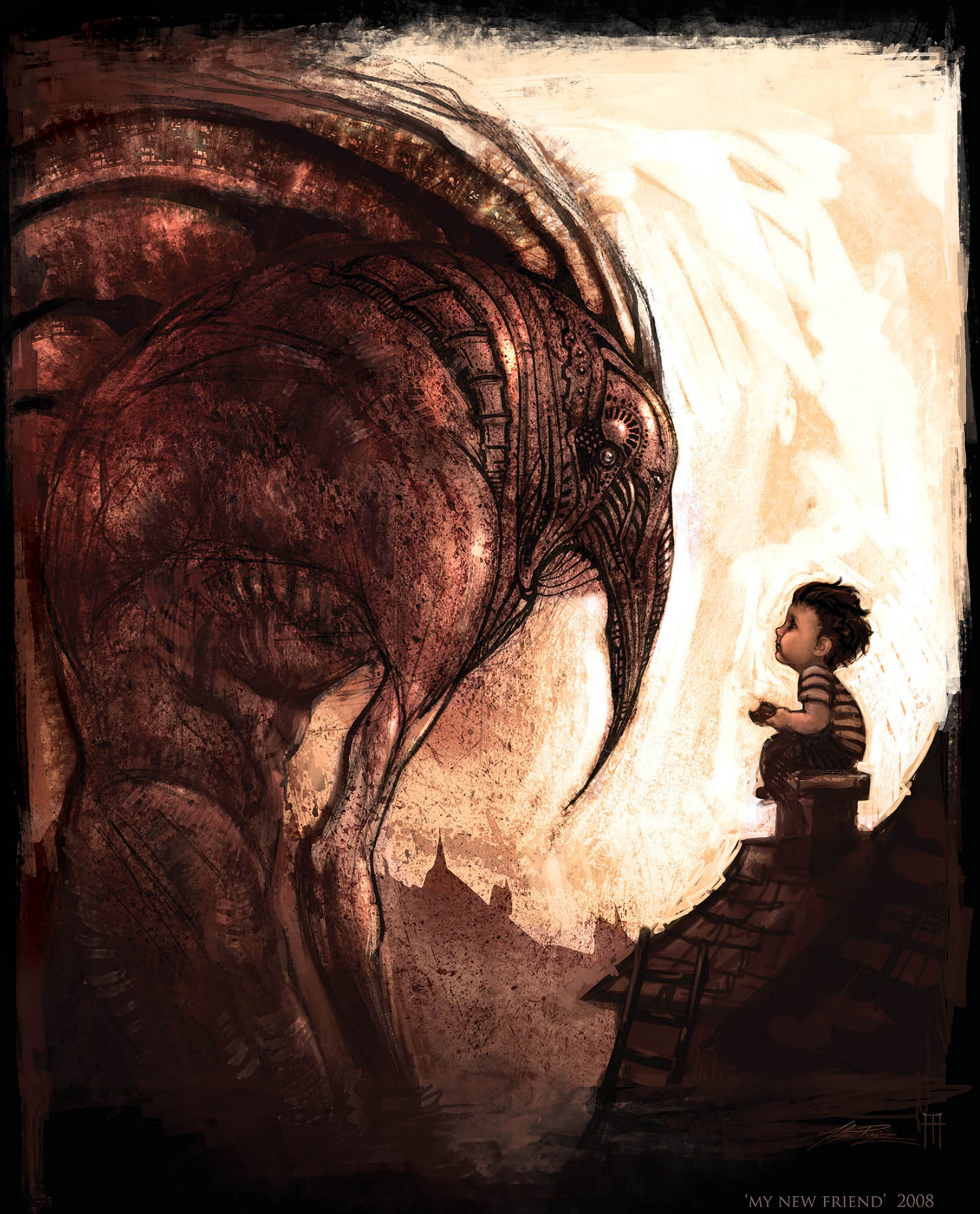
'MY NEW FRIEND' 2008