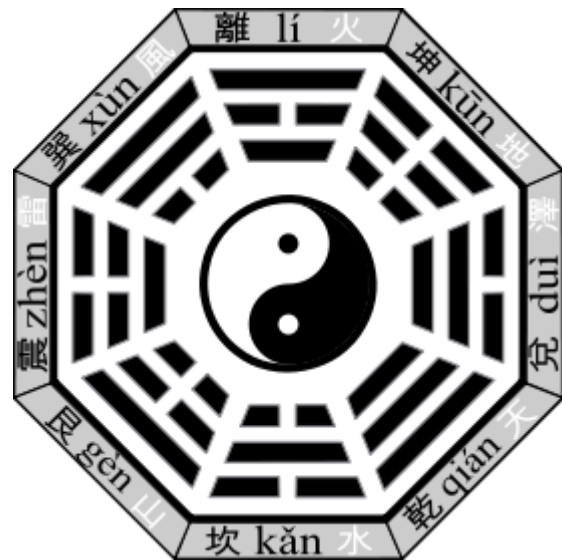
King Wen "Later Heaven" bagua arrangement