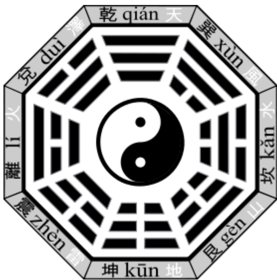
Fuxi "Earlier Heaven" bagua arrangement