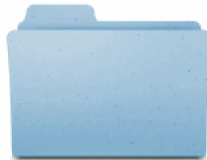
Autoresponder Format (60 Characters wide)